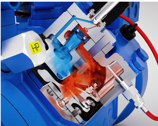
Capacity regulator inactive (solenoid de-energized): Operation of the cylinder bank at full load