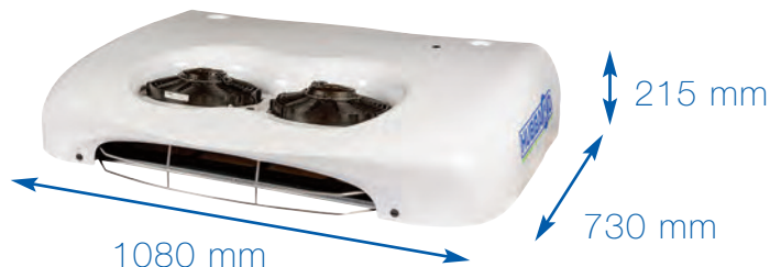
Twin Fan Evaporator (Weight 18.5 kg)